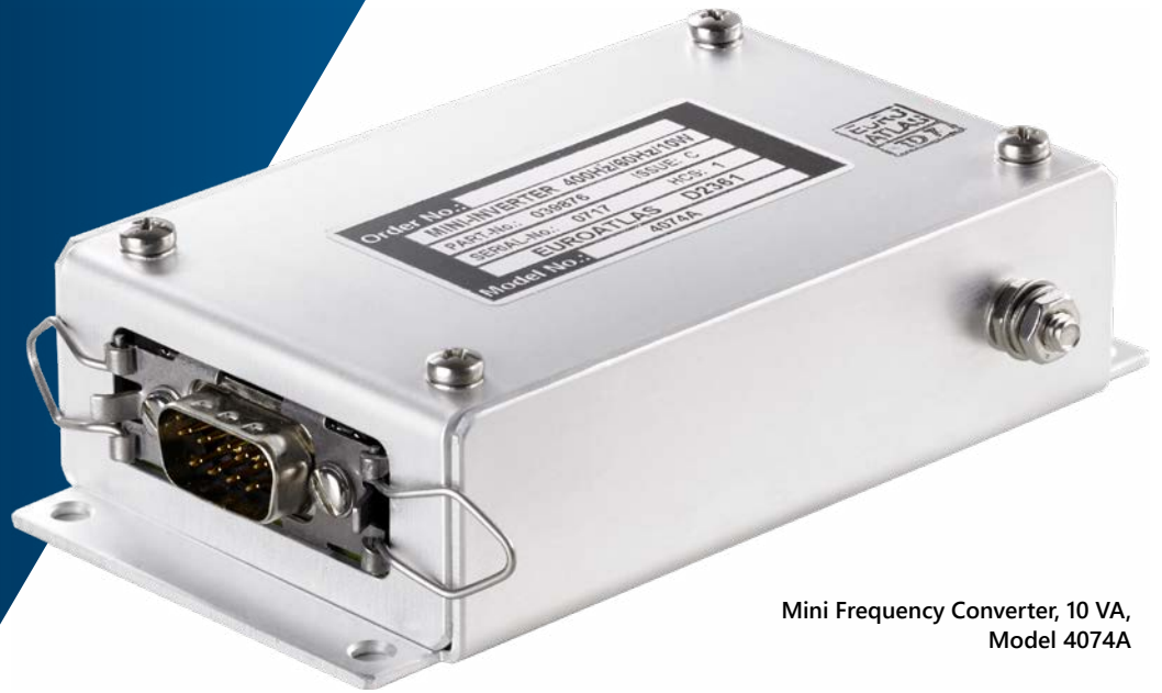
Mini Frequency Converter, 10 VA, Model 4074A